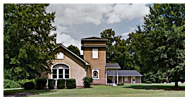
Geneva Presbyterian Church

Tour of Historic Churches in Granville and Vance counties – now scheduled for April 9-10, 2021