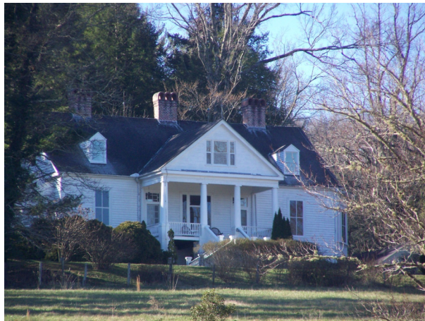
"Connemara" home of Carl Sandburg

Our Spring Tour for 2016 will take us to the Lower Blue Ridge region of southwestern North Carolina, where we will explore the stories of those who settled in this area and will visit some of their churches and old cemeteries. We will be in the PCUSA Presbytery of Western North Carolina and in the Associate Reformed Presbyterian's Synod of North Carolina.