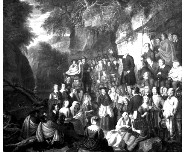
Covenanters in a Glen , painting by Alexander Carse, showing an illegal conventicle, 1680s.

The ARP Church remains close to its Covenanter roots. Its doctrine is based on the Bible, "infallible in all that it teaches and inerrant in the original manuscripts," and on the Westminster Confession and the Catechisms Larger and Shorter. Psalms arranged in meter are generally sung in church, but a church session may allow hymns as well. Women may be deacons, but not ordained ministers or elders. The denomination is part of the North American Presbyterian and Reformed Council and the World Reformed Fellowship. •